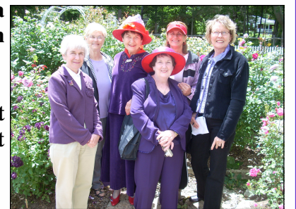
June — "The Rose Man" Nursery