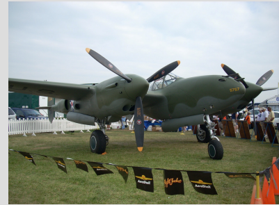
" Glacier Girl "