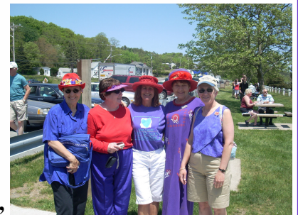
May — Cape Cod Canal outing