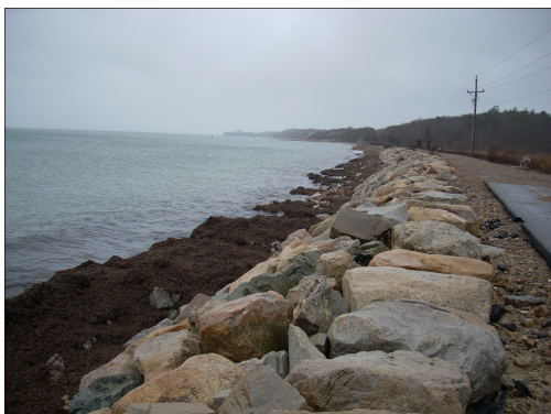
Beach area sand is gone, seaweed everywhere

For those of us who have had the good fortune to be able to walk/bike/rollerblade the Shining Sea Bike path in Falmouth and enjoy one of the most beautiful and scenic experiences that our area has to offer; we found that some damage was done to our bike path during the last storm. The bike path and beach suffered due to the tidal surge. We will have to wait for the town to clean up the paved area and the damage to the beach which was more extensive.