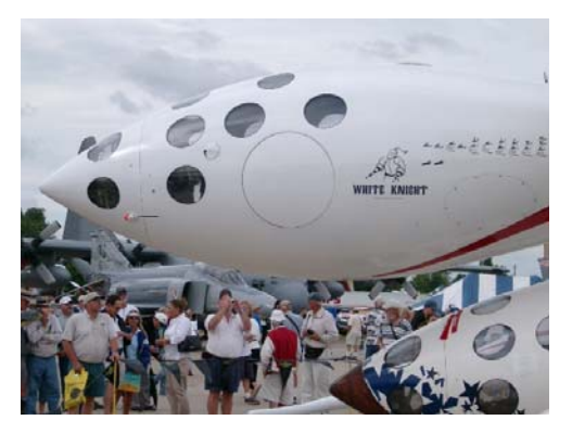
White Knight/ Space Ship One